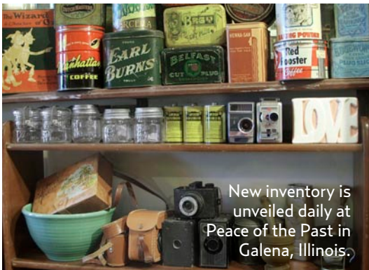
New inventory is unveiled daily at Peace of the Past in Galena, Illinois.

IT’LL COST $37 each (the four-bedroom house sleeps up to eight, for $295 a night).