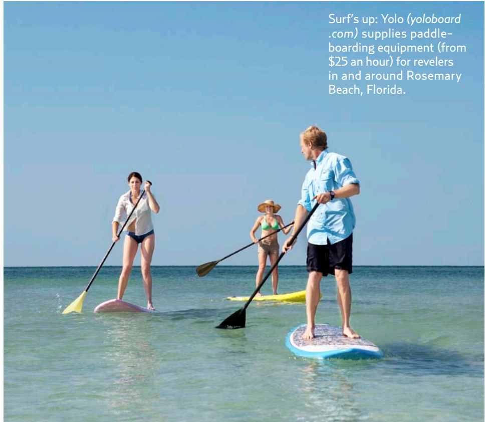
Surf's up: Yolo ( yoloboard.com ) supplies paddleboarding equipment (from $25 an hour) for revelers in and around Rosemary Beach, Florida.

IT'LL COST $79 each (the five-bedroom house sleeps up to 10, for $793 a night).