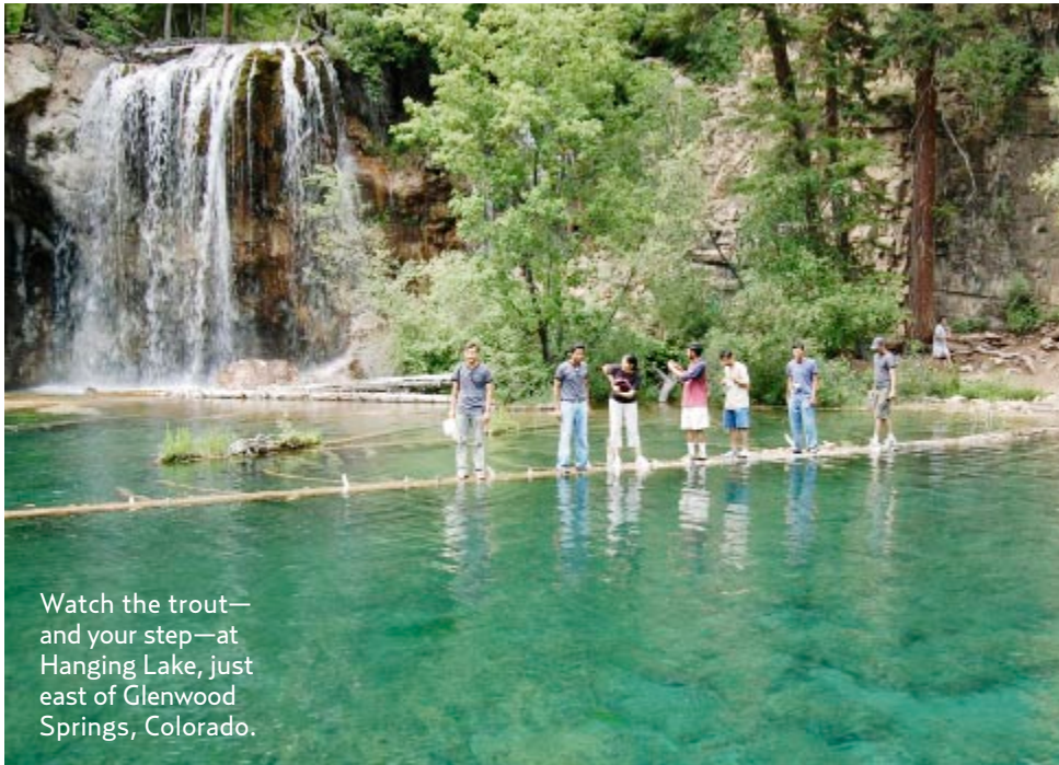
Watch the trout—and your step—at Hanging Lake, just east of Glenwood Springs, Colorado.